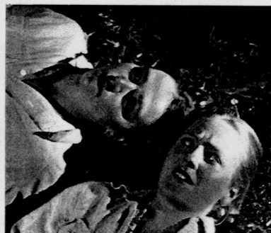
Weeki Wachee Girls